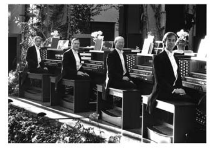
Send $24.95 + $2.00 mailing to: The Philadelphia Organ Quartet DVD 8 Anvil Court, Cherry Hill, NJ 08003

The Philadelphia Organ Quartet DVD NOW AVAILABLE FOR THE FIRST TIME! FULL LENGTH LIVE CONCERT RECORDING